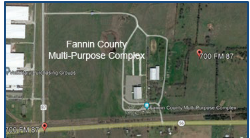
Intersection of Hwy 56 & FM 87

From the East on I-20 take Exit 556 towards Lindale, keep Right at the fork and merge onto S. Main Street (US-69). Follow North through Greenville until you reach FM 896 in Leonard. Turn Right onto FM 896 and continue North to Randolph. Turn Right on Queener St. then Left onto TX-11 W then turn Right onto TX-121 Business North to merge onto TX-121 N. Turn Left onto TX-311 Spur N which intersects with TX 56 W. Turn Left onto TX 56 W. In approximately 1.5 miles turn Right on to FM 87 N and then Right into the Complex.